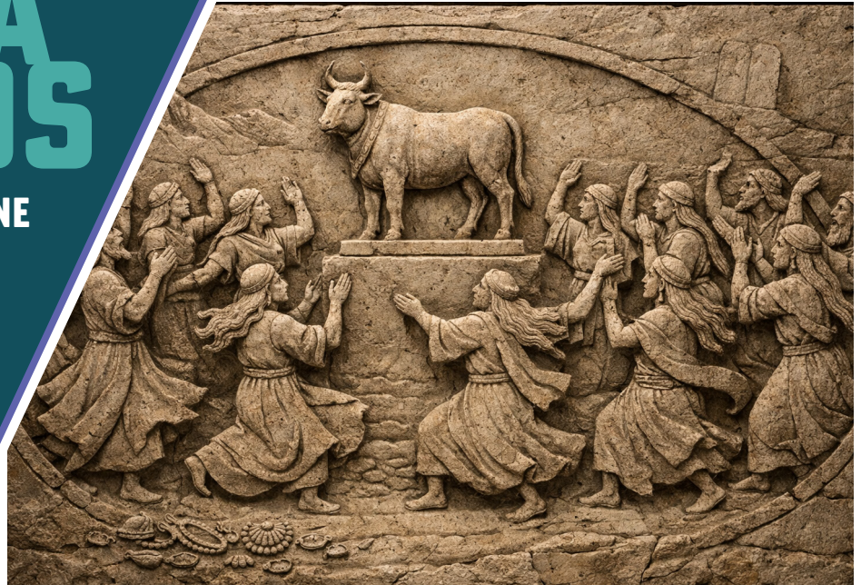
Disclaimer: These AI generated images are NOT meant to portray actual people or events from the Torah. They are simply hints to get you thinking.

This features an AI generated picture that has numerous hints to the weekly parsha. This week's is about Parshas Ki Sisa